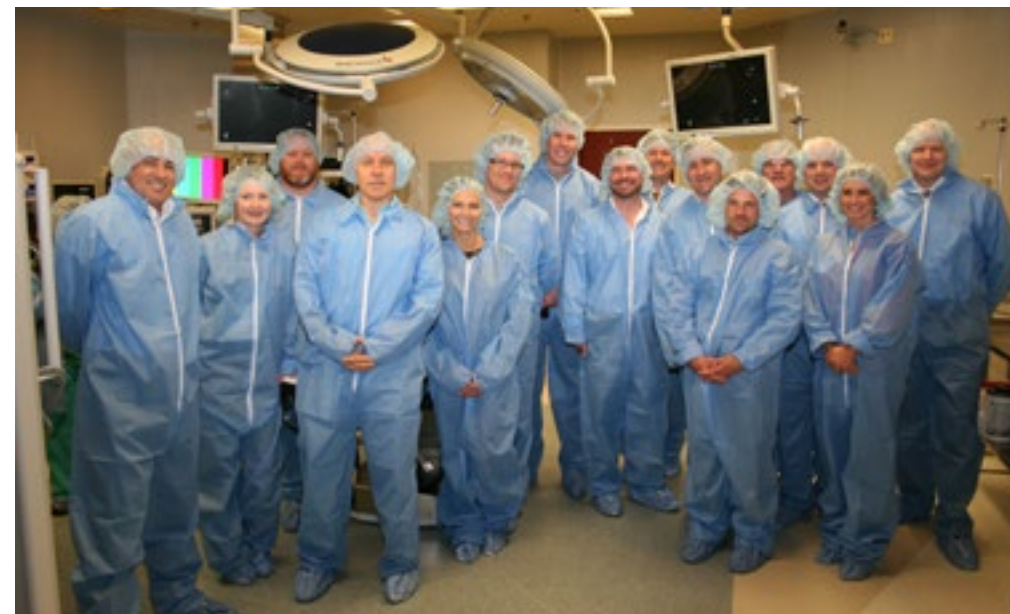
AnMed Health Foundation Ambassadors scrub in for a tour of a North Campus surgical center.